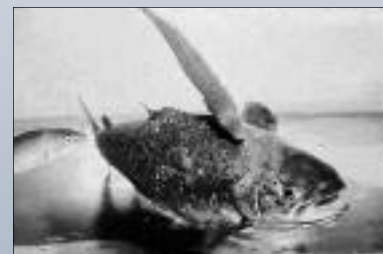
Goldsinny cleaning salmon