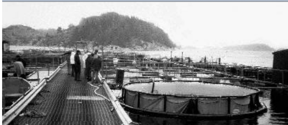
Salmon cages, Austevoll Marine Station, Norway